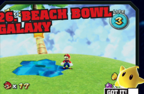
26: BEACH BOWL GALAXY LIFE 3 Sunken Treasure: Find the five star pieces in the water, and make your way to the top of the hill.