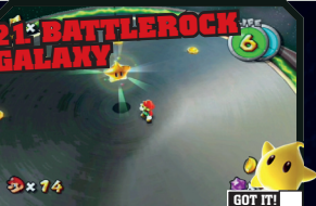
21: BATTLE ROCK GALAXY LIFE 6 Topmaniac and the Topman Tribe: Jump on the boss's head and then spin attack it into the electric barrier three times.