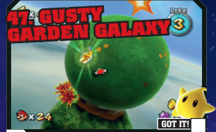
47: GUSTY GARDEN GALAXY LIFE 3 The Golden Chomp: Grab all the question coins for invincibility and then destroy the golden chomp.