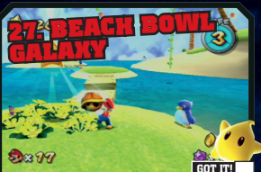
27: BEACH BOWL GALAXY LIFE 3 Passing the Swim Test: A penguin in the water has the golden shell. Go get it.