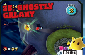
35: GHOSTLY GALAXY LIFE 3 A Very Spooky Sprint: Finish first against the Ghost.