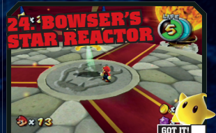
24: BOWSER'S STAR REACTOR LIFE 5 The Fiery Stronghold: Have Bowser pound a round metal section so that his tail catches on fire. Then spin attack his tail and then Bowser three times.