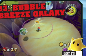
33: BUBBLE BREEZE GALAXY LIFE 2 Through the Poison Swamp: Navigate around the planet using the bubble.