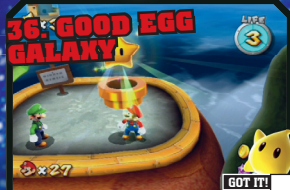
36: GOOD EGG GALAXY LIFE 3 Luigi on the Roof: Use the orange pipe to get to the roof with Luigi on it for this star.