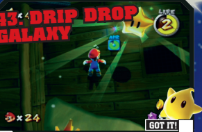
43: DRIP DROP GALAXY LIFE 2 Giant Eel Outbreak: Find and use the red shells on the ocean bed to take out all of the eels.