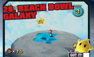
28: BEACH BOWL GALAXY LIFE 3 The Secret Undersea Cavern: Use a green shell to open the cave and then get to the end.