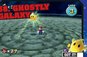
38: GHOSTLY GALAXY LIFE 3 Beware of Bouldergeist: You need to hit the boss three times with the bomb ghosts, reveal his core and hit that twice more.