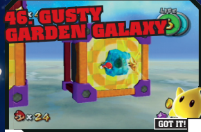
46: GUSTY GARDEN GALAXY LIFE 3 Gusty Garden's Gravity Scramble: Plenty of surprising gravity tricks here, so take it slow.