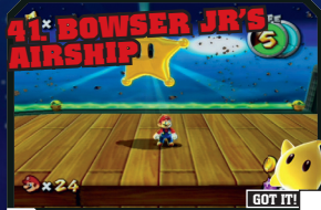
41: BOWSER JR'S AIRSHIP LIFE 5 Sinking the Airships: To defeat Bowser Jr, you need to hit his airship a total of five times with green shells. Fire away!