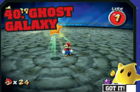
40: GHOST GALAXY LIFE 7 Bouldergeist's Daredevil Run: You need to complete the boss fight again without taking a single hit.