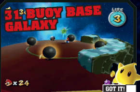
31: BUOY BASE GALAXY LIFE 3 The Secret of Buoy Base: Use a Bullet Bill to blow open the cover of the warp pipe to the green star.