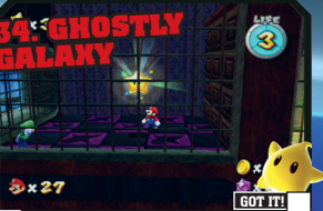
34: GHOSTLY GALAXY LIFE 3 Luigi and the Haunted Mansion: Use the Ghost power-up to work your way to Luigi.