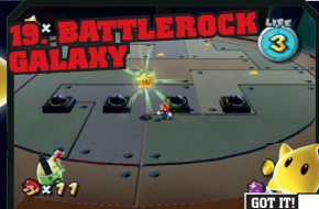
19: BATTLE ROCK GALAXY LIFE 3 Battlerock's Garbage Dump: Use the bombs to clear the rubble in under 30 seconds.