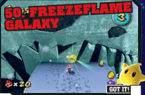
50: FREEZEFLAME GALAXY LIFE 3 The Frozen Peak of Baron Brrr: Jump over his shockwaves and Spin Attack the Baron three times.