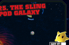
25: THE SLING POD GALAXY A Very Sticky Situation: Line up your shots carefully, and sling yourself into the star at the end.