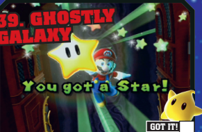
39: GHOSTLY GALAXY LIFE 3 Matter Splatter Mansion: Via 'A Very Spooky Sprint', open the rock to the right at the start.