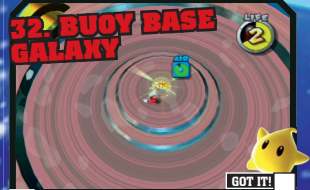
32: BUOY BASE GALAXY LIFE 2 The Floating Fortress: Raise the platform and collect the five blue star bits.