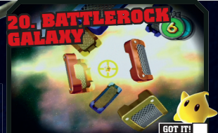
20: BATTLE ROCK GALAXY LIFE 6 Breaking into the Battlerock: Use the bomb to open up the cannon to the star.