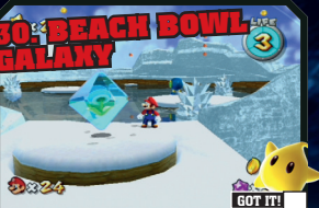
30: BEACH BOWL GALAXY LIFE 3 Wall Jumping up Waterfalls: Use a green shell on a hidden chest to the far right of the level.