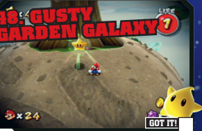
48: GUSTY GARDEN GALAXY LIFE 7 Major Burrow's Daredevil Run: You need to beat the boss without being hit.