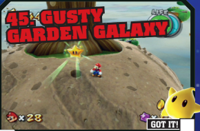
45: GUSTY GARDEN GALAXY LIFE 3 The Dirty Tricks of Major Burrows: Pound the ground when he's surfaced then spin attack him three times in total.