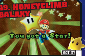
49: HONEYCLIMB GALAXY Scaling the Sticky Wall: Take your time, stay in between honeycombs and go carefully to the top.