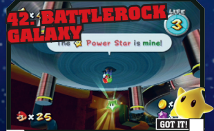
42: BATTLE ROCK GALAXY LIFE 3 Luigi under the Saucer: Choose the first star again, and at the end, lure a Bullet Bill under the saucer and across to where Luigi is.