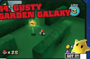
44: GUSTY GARDEN GALAXY LIFE 3 Bunnies in the Wind: Hit the bunny with star bits to catch it quicker.