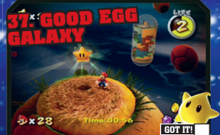
37: GOOD EGG GALAXY LIFE 2 Dino Piranha Speed Run: Simply finish the very first level again in under four minutes.