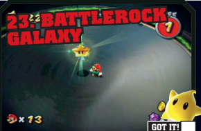
23: BATTLE ROCK GALAXY LIFE 7 Topmaniac's Daredevil Run: Complete the course without taking any damage!