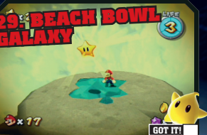
29: BEACH BOWL GALAXY LIFE 3 Fast Foes on the Cyclone Stone: Repeat the previous planet, but with faster enemies.